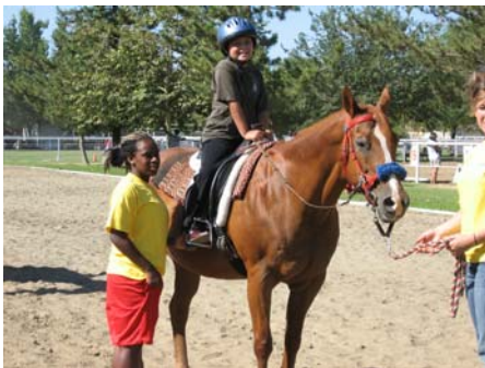
Nominated for the NARHA Equine Recognition Award 2007

Elvira is a 24-year-old race bred Quarterhorse mare. She was raced as a two- and three-year old at Bay Meadows, Hollywood Park and Los Alamitos. Her best finish was 2nd so her owners decided that Elvira was not the racehorse of their dreams. Elvira then went on to become a saddle horse. Since her race days, Elvira has had training on cattle, beginning reining and dressage. She has also spent many hours out on the trail. Elvira’s attitude and temperament add another dimension to our program as